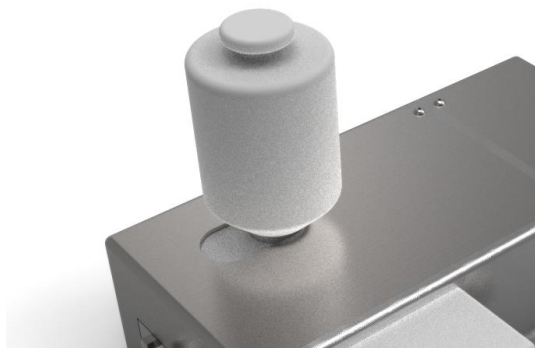
5g capacity container