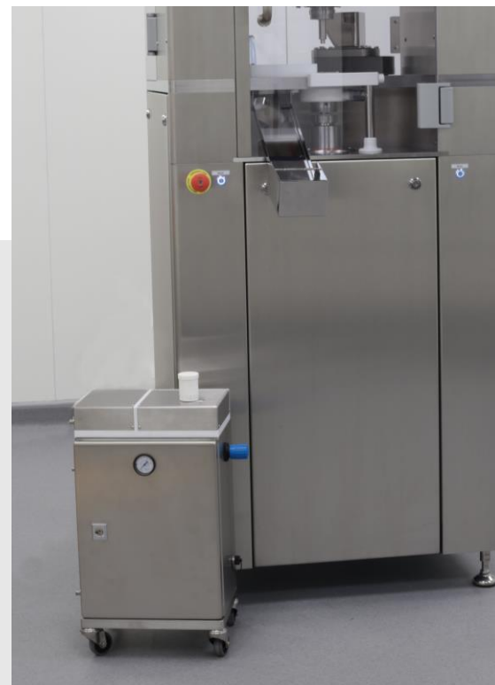
Micro-dosing unit + pulsed air blow cabinet connected to a STYL'ONE Tableting Instrument