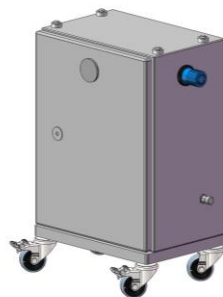
Pulsed air blow cabinet